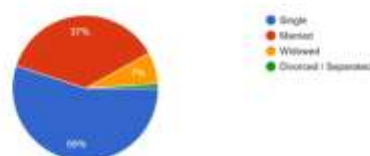
Q3. Marital Status 100 responses

The majority of respondents (38.8%) belong to the 35–45 age group, indicating strong participation from middle-aged women. This is followed by below 25 (20.4%) and above 55 (19.4%), showing representation from both younger and older groups. The least respondents are from 45–55 (9.2%) and 25–35 (12.2%) categories. Overall, the data reflects a diverse age distribution with higher involvement from women in their mid-life stage.