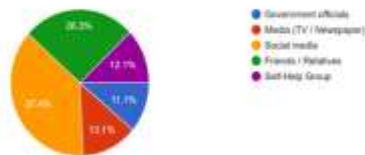
Q8. How did you come to know about the Mukhyamantri Majhi Ladki Bahin Yojana? Question type: Multiple Choice 99 responses