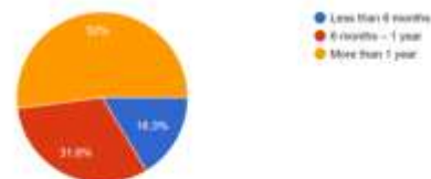
Q9. Duration of availing benefits under the scheme Question type: Multiple Choice 99 responses

The majority of respondents (55%) are married, indicating that the scheme largely benefits women managing household responsibilities. Widowed women account for 37%, showing significant support for financially vulnerable groups. Only a small percentage (7%) are single, with minimal representation from divorced or separated women. This suggests the scheme mainly reaches married and dependent women.